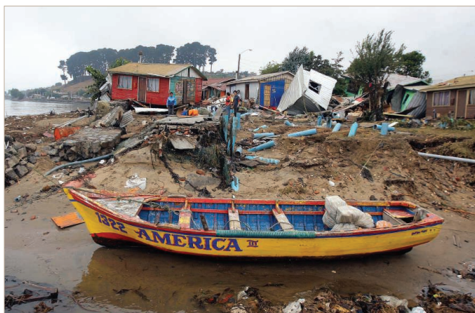
Tsunami damage. Shortly after the Maule mega-earthquake, a tsunami hit nearby coastal areas, such as the village of Penco (near Concepción), shown here.

In the second figure, we show the plate coupling in the area of the Maule earthquake derived from all available GPS data. The red areas