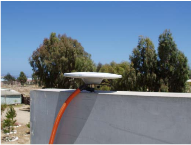
BTON: Trimble Zephyr Antenna