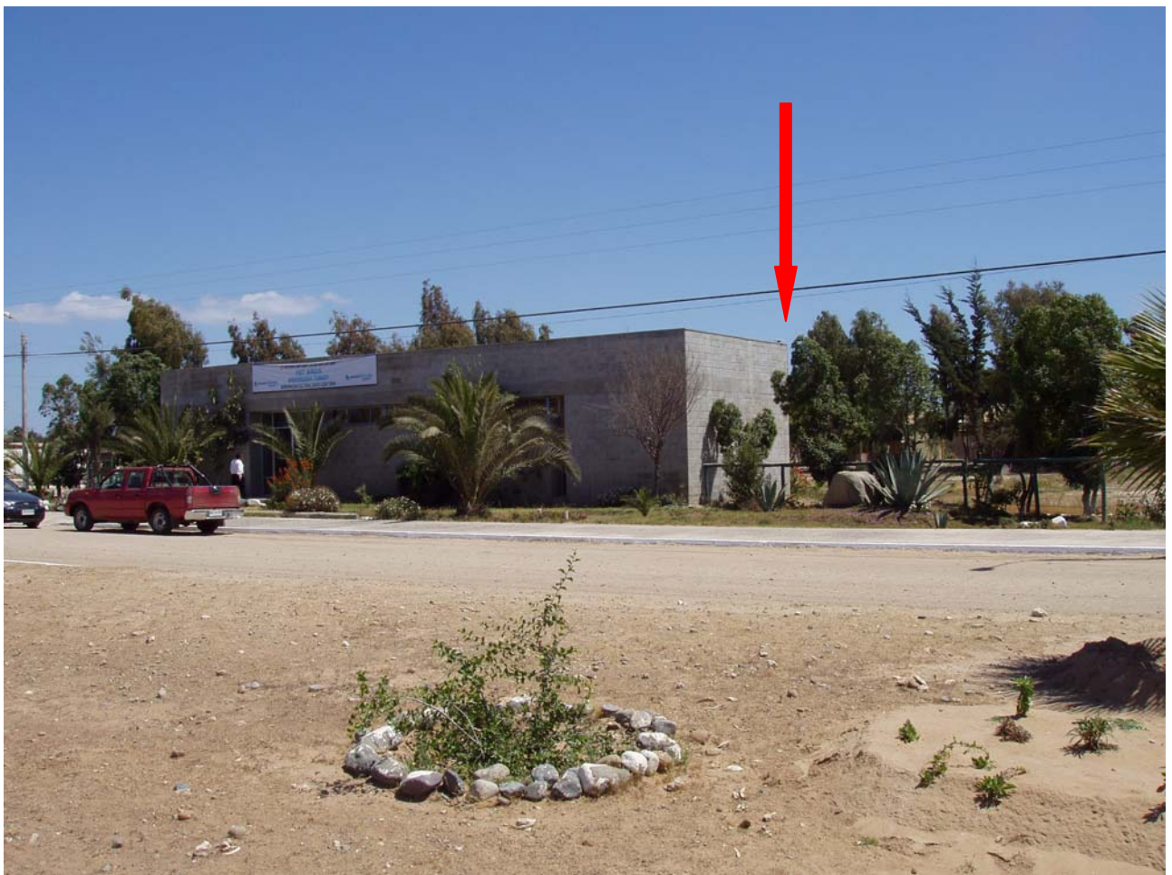
BTON: Biblioteca Tongoy