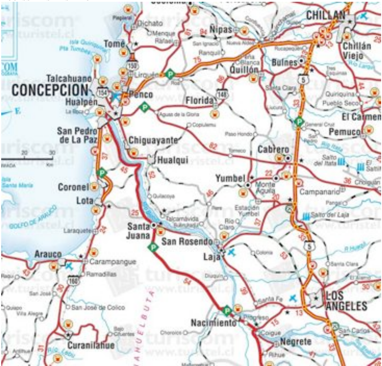
PLAJ_perm_new.doc ACCESS and SITE SKETCH MAP