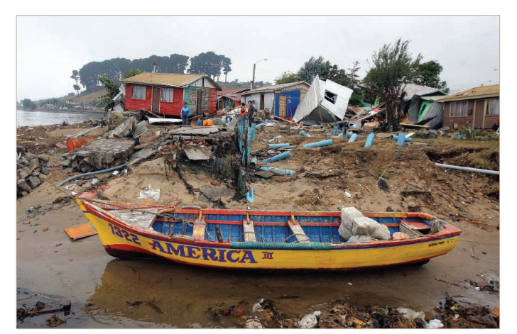
Tsunami damage. Shortly after the Maule mega-earthquake, a tsunami hit nearby coastal areas, such as the village of Penco (near Concepción), shown here.

www.sciencemag.org SCIENCE VOL 328 9 APRIL 2010 Published by AAAS